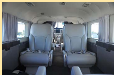
Nine passengers can fly with plenty of leg room. The middle seats face each other and tables fold down for the passengers to share.