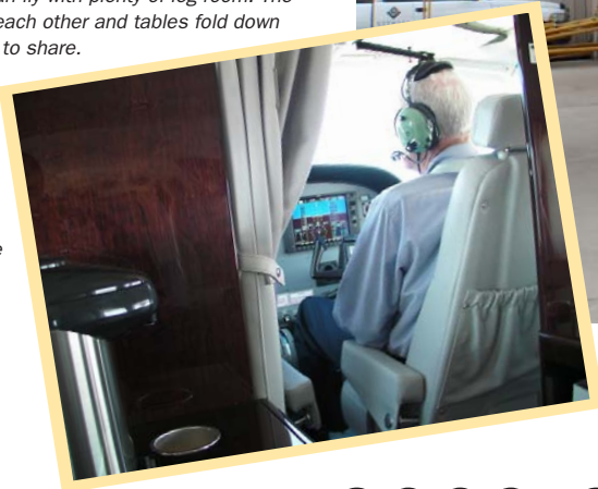
The Grand Caravan is rated to fly with one pilot. The Pratt & Whitney PT6 engine offers unparalleled reliability and performance.